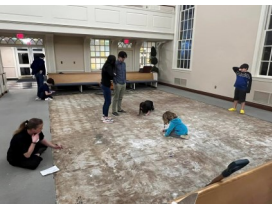
Writing on the floor

And then there were the cushions. All the pew cushions. All the 20+ year-old never-been-cleaned pew cushions. The extracted water was as black as strong coffee. Once cleaned, however, those cushions revealed a wealth of wax drippings from the candles of Christmases Past, the tedious removal of which took over six hours of tender loving care from Cherry Stevens. (It also explains why we now use battery operated candles for Christmas Present and