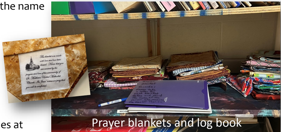
Prayer blankets and log book